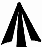
THE BROAD ARROW

For reasons unknown, the bulk of the queries and replies has not been received by the Editor as of 7 October 1979. The inconvenience is regretted. However, it is preferable to have a Newsletter on schedule rather than to delay its appearance until the queries were received.